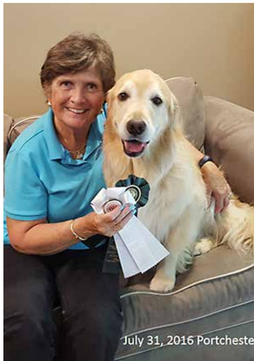
July 31, 2016 Portchester Obedience Training Club