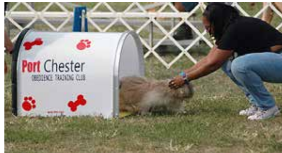
Dogs at PCOTC's My Dog Can Do That! ring try, clockwise from top left: the wobble board, a chute barrel, weave poles, jumps, contact trainer, and teeter.